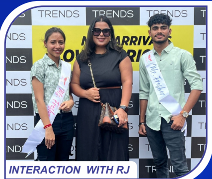
INTERACTION WITH RJ