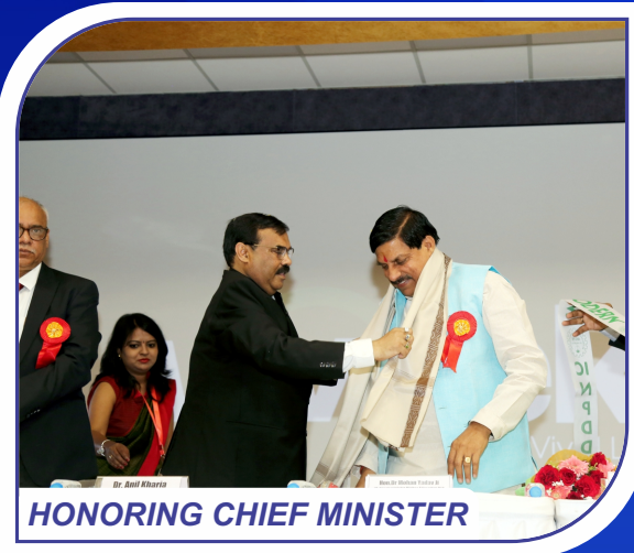
HONORING CHIEF MINISTER